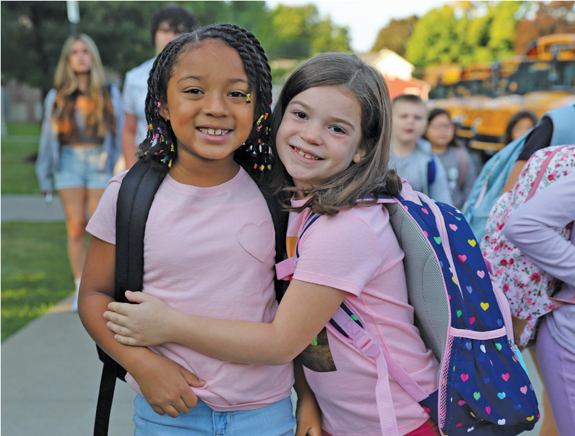
Elementary friends at the bus loop.

The 2024-25 school year at Akron Schools was filled with student success and enriching opportunities, a glimpse of which is captured by dedicated faculty and staff at akronschools.org or on our Facebook page @AkronCentralSchoolDistrict .