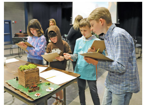
Grade 5 Ancient Artifact Museum.