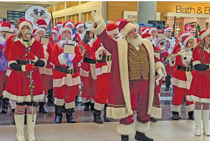
Santa's Helpers Band performs with Santa at Galleria Mall.