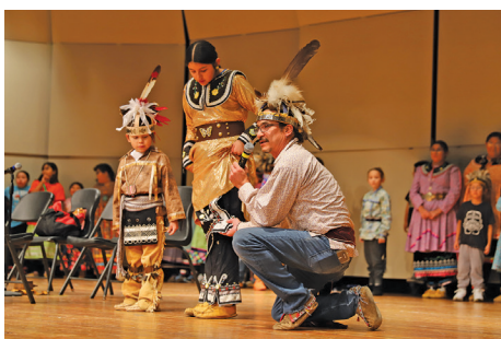
Traditional Native dress clothes described at social dancing assembly.