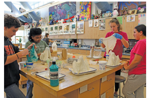
Art Club members make a spooky Halloween decoration using cheesecloth and glue.