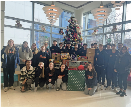
Basketball teams make toy donations for patients at Oishei Children's Hospital.