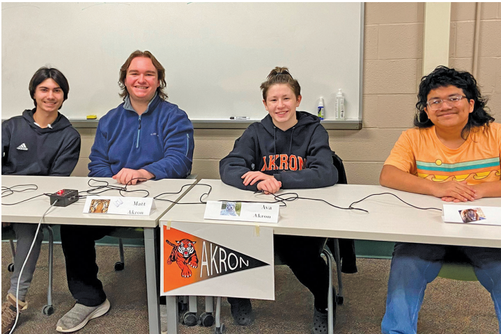
Scholastic Bowl enjoys a winning season in both GV BOCES and WLVL leagues.