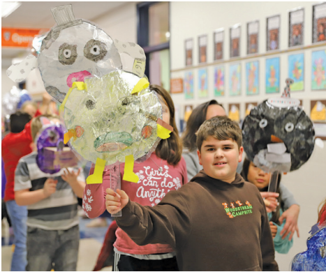
"Balloons over Bloomingdale" by our 4th graders returns for Thanksgiving.