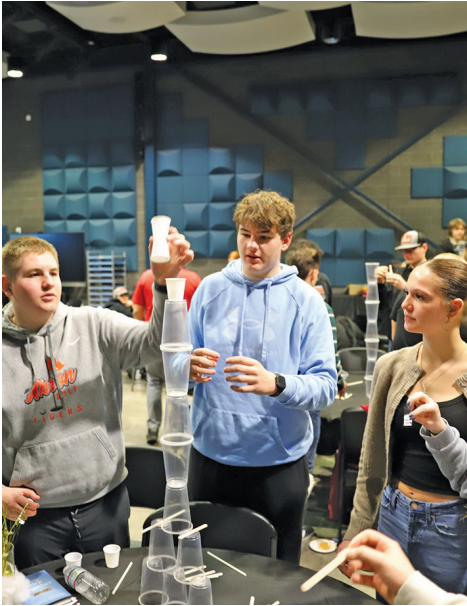
Team-building exercise at High School Leadership Conference.

in these photos. Discover more stories and photo galleries highlighting the achievements of our students and the commitment of our