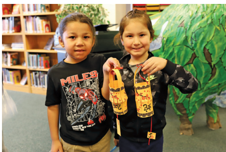
Chinese lantern-making at the Lunar New Year Celebration.