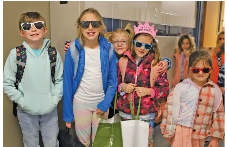
Red Ribbon Week - Students Too Bright to do Drugs!