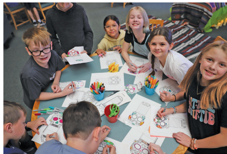
Day of the Dead celebration in the LMC.