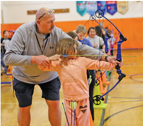
Elementary students learn archery in PE.