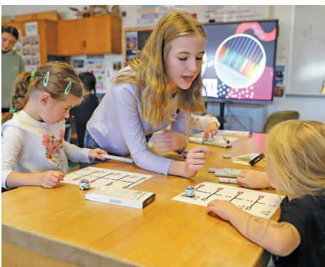
MS & KDG Tech Buddies teaching and learning with Ozobots.