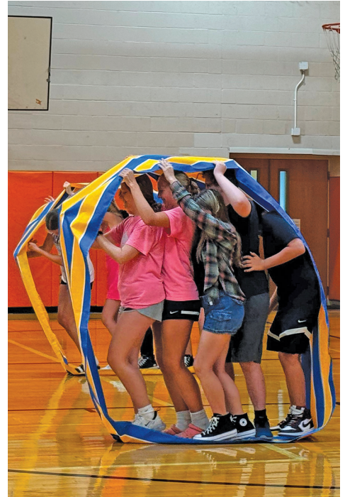
Keeping it fun at Freshmen & New Student Orientation.