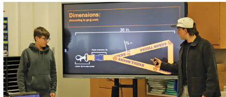
Intro to Business students make product pitch for Market on Main.