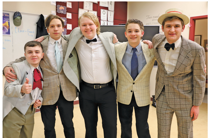
Friends from The Music Man production.