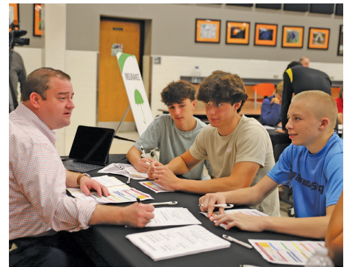
Juniors experience Bank on Buffalo's Financial Reality Fair.