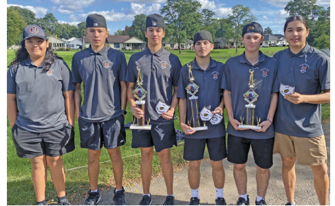
Golf team goes undefeated! N-O League Champs and winners of All-League Tournament.