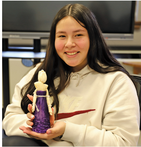
Seneca language student shows off the corn husk doll she made!