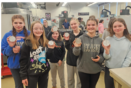
8th graders participate in Manufacturing, Construction & Trade activities at SUNY ECC.