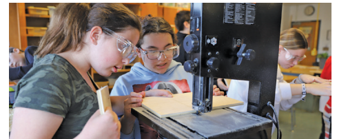
Grade 8 CDE students at the band saw.