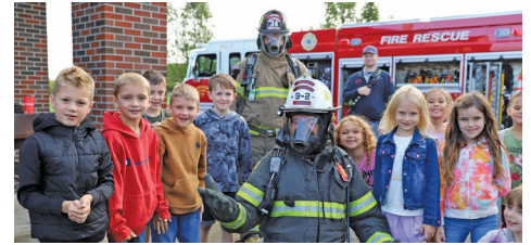
Fire Safety Week with Akron & Newstead Fire Companies. We thank you!