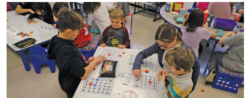
Fifth graders help kindergarteners learn BINGO game.