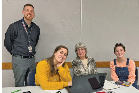
Interact Club members are tech coaches at Newstead Senior Center.