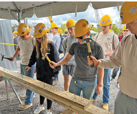
Construction Career Day at the Operating Engineers Training Facility.