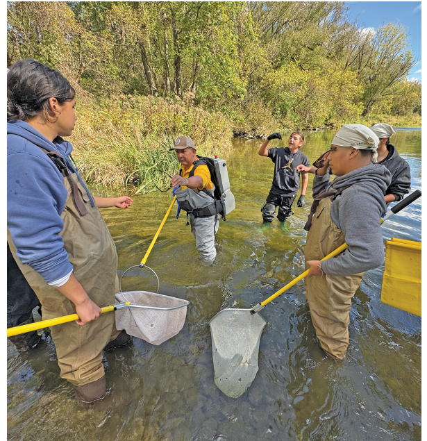
Indigenous students explore The Big Woods.