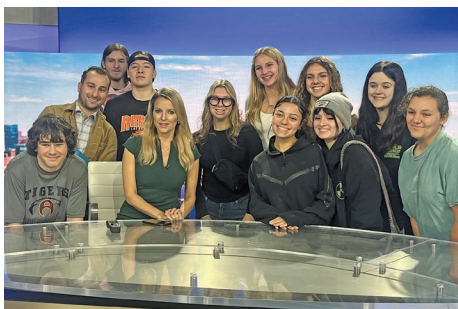
Media Production class gets Channel 7 tour.