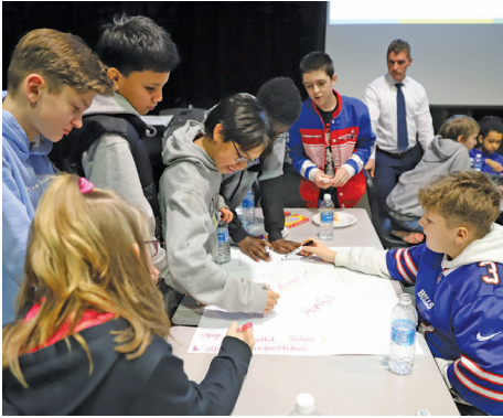
Middle schoolers collaborate at bullying prevention workshop.