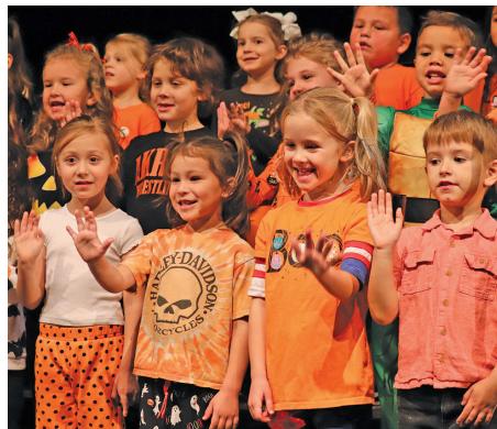
Elementary students perform at "Homegrown" assembly.