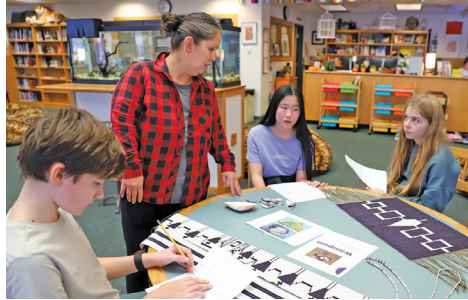
Wampum creation and use explained at the US History Fair.